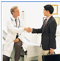
In Pictures: Doctors Who Deliver